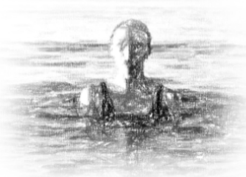
Phase 3: Go in up to your neck