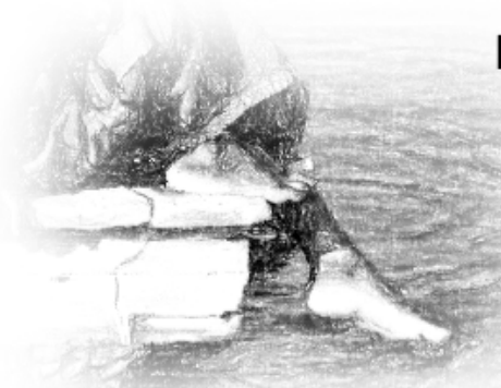
Interested in Ungrading?